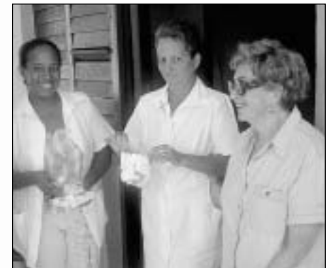
Learning in Retirement

Connecting the University and the community