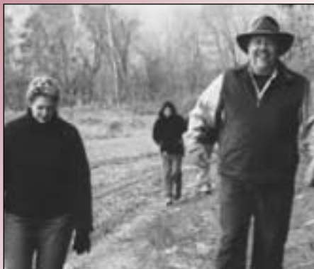
Conferences & Workshops