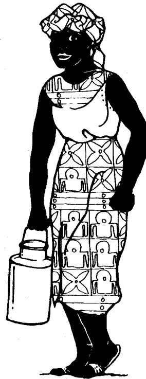
Intermediate Technology Group

Mortgaging Women's Lives , on the other hand, documents the impact of economic reforms throughout the Third World (the South). Many of the case studies involve original data collected by the authors in Ghana, Turkey, Sri Lanka, the Phillipines, and Nigeria. For Jamaica, an oral history format is used. According to the editors, the book is an attempt to bridge the academic and activist worlds. It is for economists and non-economists alike. The first two chapters explain what structural adjustment policies are, what role the World Bank and the International Monetary Fund play