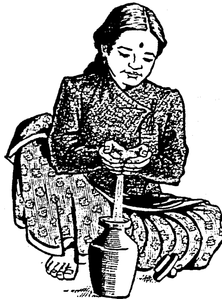
Intermediate Technology Group