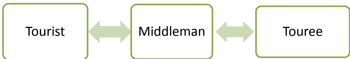
Figure 1: Ethnic Tourism Framework (Van den Berghe & Keys 1984; Yang & Wall 2009)

Van den Berghe and Keyes (1984) identify three components of ethnic tourism: the tourist, the touree, and the middleman. The touree is the ethnic group that creates the performance for the tourist. The key characteristic of the touree is the performance; the touree modifies ritual for gain according to the perception of the tourists' expectations. Van den Berghe and Keyes assert that the presence of the tourists creates the touree, a functional group that represents the authentic while withholding the authentic from the tourist gaze. The tourist is in search of the authentic experience, but their very presence creates the touree. The middleman can be tour companies, private entrepreneurs, or government agencies. In this scenario, the tourist is never able to achieve an authentic experience.