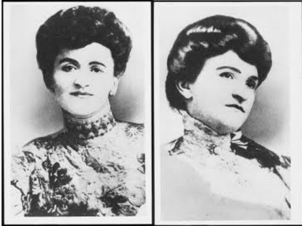
Minna (left) and Ada Everleigh, circa 1900. 13