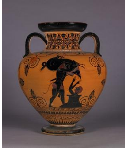
Figure 1: Hercules and Erymanthian Boar. (Pottery – Amphora). Ca. 540 – 530 BCE. London, The British Museum 1843,1103.63.

“When the child of morning, rosy-figured Dawn, appeared, the sons of Autolycus went out with their hunting hounds, and Odysseus went too. They climbed the wooded slopes of