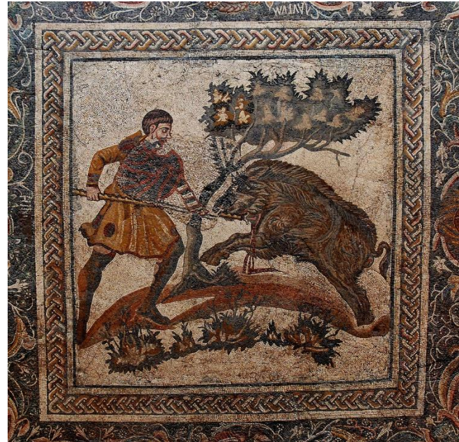
Figure 3: Boar Hunt. Floor mosaic. 4 th century CE. Merida, Spain. By Helen Rickard, CC BY 2.0, https://commons.wikimedia.org/w/index.php?curid=3474380

The idea of bravery in the face of danger reflects the thrill of the hunt that is embodied in Alexander the Great’s feelings on the matter through Plutarch. Writing in the 1 st to the 2 nd centuries CE, Plutarch wrote various biographies, only one of which was Macedonian: Alexander the Great. On the subject of cultural appropriation within Alexander’s army during the