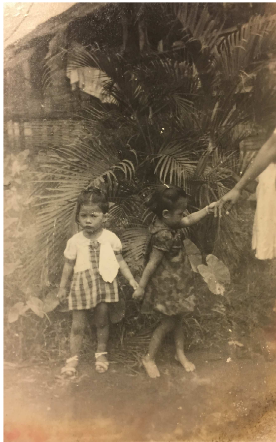
Figure 2.8. Two Filipino girls. Includes the caption: “These are two little nieces of the bride shown in one of the other pictures. Carigara, Leyte Island.”

would impact the Filipinos. 46 In addition to the harsh treatment inflicted upon the Filipinos by the Japanese, this practice left the Filipinos without much on which to sustain themselves. 47 When the Americans reclaimed and resumed occupation of the Philippines, they found what Hahn describes in his caption—a country with “practically nothing.” Hahn’s attribution of the Filipino situation to the Japanese is correct in that the Japanese occupation of the Philippines exacerbated what was already problem and left the Filipinos without much to sustain themselves. This food shortage then led to the Filipinos depending upon the United States until they could alleviate the situation.