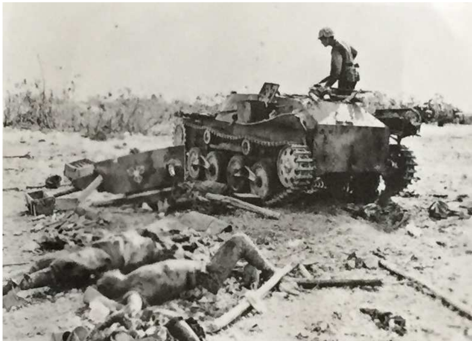
Figure 3.2. Soldier in tank overlooking the dead.

At the end of the brown photograph album, there are twenty-five photographs that have been separated from the rest of the content by a series of pages containing commercially produced postcards. The postcards that precede these photographs fill seven pages and are all artistic renditions of a variety of subjects. The postcards include images of natural landmarks in Utah and Colorado as well as a series of postcards depicting cowboys and their horses in the west. They divide the photographs at the end from the rest of the album's content. Included among the images quarantined at the end of the album are photographs that depict the more brutal and graphic aspects of war. One of these images is shown in Figure 3.2 which depicts a soldier emerging from a small tank. In the foreground of the photograph, however, are two