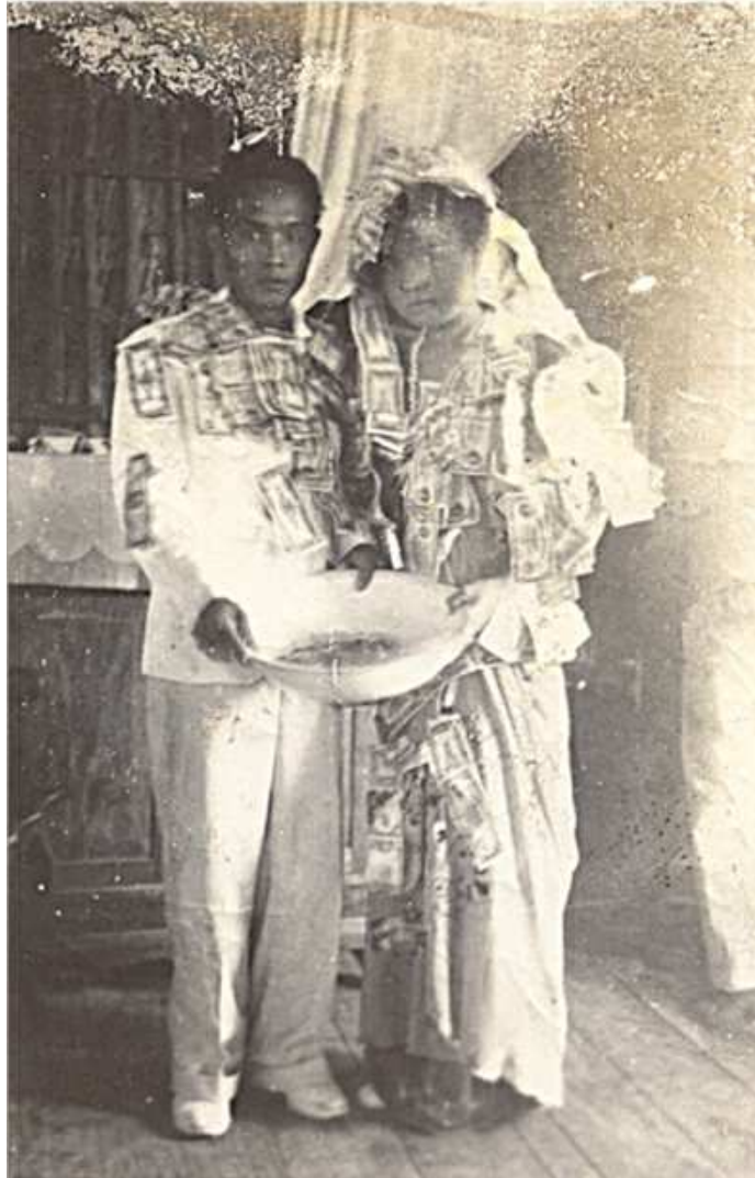
Figure 2.6. Filipino bride and groom. As two of the same image are present in Hahn’s collection, two alternative captions are present. Caption one includes: “This couple invited me to their wedding. I took this picture after a dance ceremony they had where guests showered coins in bowl in middle of floor and pinned Philippino money on them.” Caption two includes: “During ceremony following wedding in church the bride + groom danced a Philippino special wedding dance where guests showered coins in bowl in middle of floor and pinned Philippino money on them as token of friendship.” Herbert Hahn Brown Album, Herbert Hahn Collection, in author’s possession.

In Figure 2.6, a Filipino bride and groom are shown standing in front of a doorway in which a sheet, acting as a door, has been pulled aside. They are dressed similarly to what one might expect a couple in the United States to have worn for a wedding, in that the groom appears dressed in a white suit, while the bride wears a white gown. Between them, the couple holds a