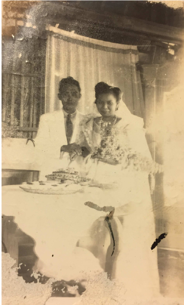
Figure 2.7. Filipino bride and groom standing in front of cake. Includes the caption: “Here they are cutting their wedding cake. Rations the army issued Philipinos had to be used to make cake. They were also allowed use of army field range to bake it on. They have practically nothing to cook with themselves. Most everything had been taken and destroyed by Japs.” Herbert Hahn Brown Album, Herbert Hahn Collection, in author’s possession.

bowl filled with contents that have been blurred in the development of the photograph, but, according to the caption are coins. More notable than the bowl, is the fact that the couple has money pinned to them with the bride appearing to have received most of it. The caption informs the viewer that this was done following a dance that was particular to the Philippines and was a “token of friendship.”