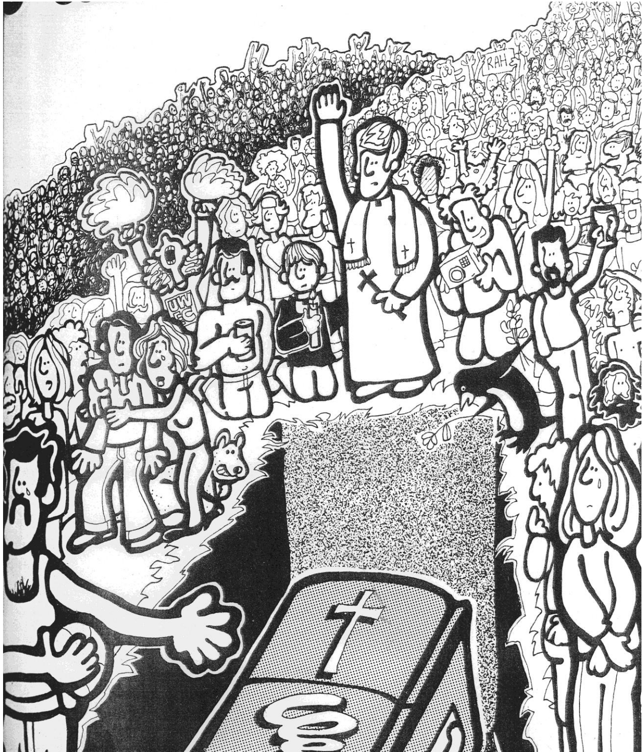
Portrayed is a comic located in the 1977 Periscope . It portrays the death of the “Tornado Watch.”