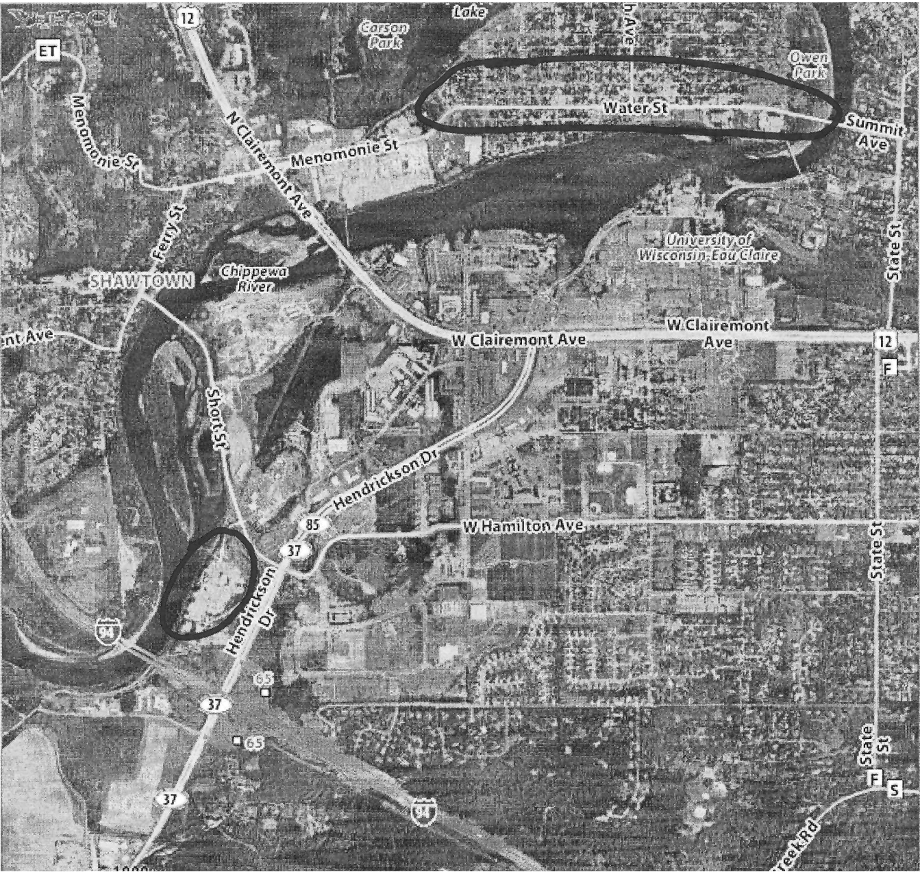
Map of the Town of Brunswick and the Eau Claire Area. Circled is Water Street and the area where “Tornado Watch” was held.