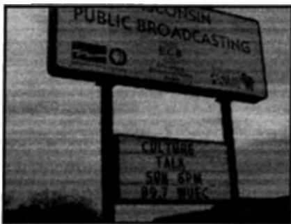
Figure 1. Wisconsin Public Broadcasting sign promotes "Culture Talk" radio program