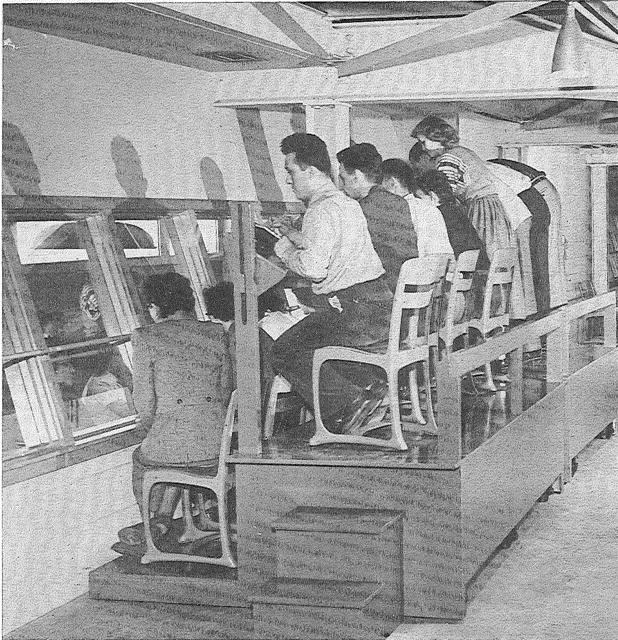
Figure A. 2: Students observe a class in session through the one-way glass within the Lab School (October 1953)