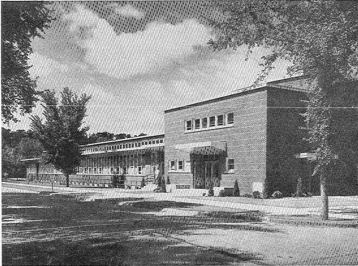
Figure A. 1: Laboratory Schoolhouse (June 1953)

Source Accessed: Lester Emans, "Pre Service Education of Teachers: Laboratory School House," Nations Schools 51, No. 6 (June 1953): 67, Emans Papers, Publications & Speeches, Eau Claire, WI.