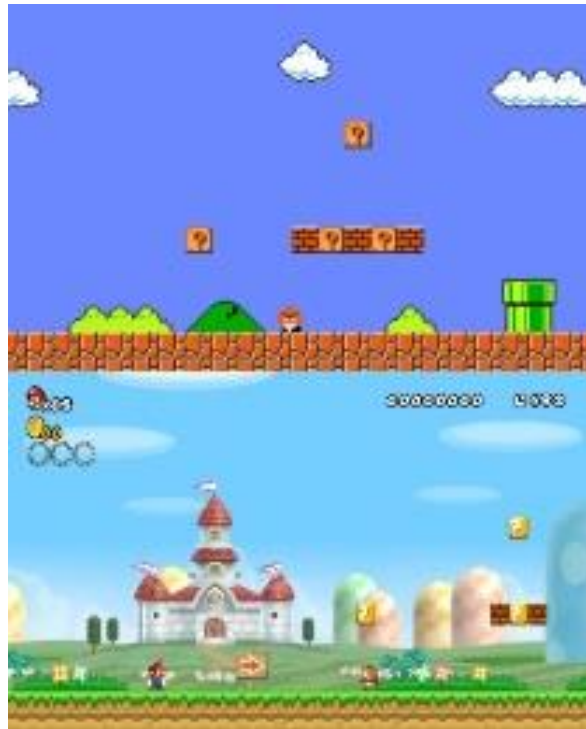
Figure 2 – Above: The first level from the original Super Mario Bros.

Mario Bros. series. The game's soundtrack integrates new, original compositions with remixed modern versions of classic tunes. The sound effects, like the soundtrack, also lean heavily on audio cues repurposed from prior Mario games. Mario's early 3D adventures are also given a nod through the incorporation of animation sequences and abilities from Super Mario 64 . By focusing on remediating and reconfiguring content, Nintendo appeals to nostalgic players and new players concurrently through a game which is both brand new and still immediately familiar for players.