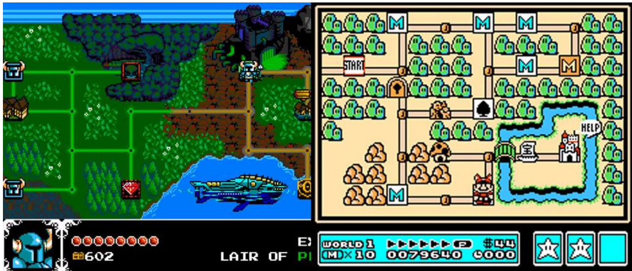
Figure 5- Left: Shovel Knight's map. Right: Super Mario Bros. 3's map

Most importantly, Shovel Knight revels in the generic form of the NES game and exaggerates tropes to display what Richard Dyer defines as “generic form qua form” or, pastiche. 125 Shovel Knight fits well into Dyer’s analysis of pastiche, genre and history as they relate spaghetti western films. Just as spaghetti westerns give us what Dyer calls a “sense of Europeans doing Americanness without quite inhabiting it,” Shovel Knight creates a sense of NES-ness and nostalgic familiarity while remaining an original, new game. 126 By drawing from a variety of influences, Shovel Knight avoids stodgily remaining faithful to any source material. Unlike remakes or games on the Virtual Console, Shovel Knight's ambiguous NES-ness highlights the best of the NES era while avoiding a backlash from players who discover their positive nostalgic remembrance does not match their modern play experience.