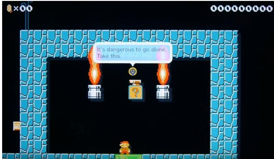
Figure 4 - A Super Mario Maker level which incorporates elements of The Legend of Zelda

As a game creation tool, Super Mario Maker allows player to engage with their Nintendo nostalgia while creating new, unique Nintendo experiences guided by their knowledge of the Mario franchise. The game also provides an army of nostalgia-fueled fan laborers who create the Super Mario Maker community within the infrastructure provided by Nintendo.