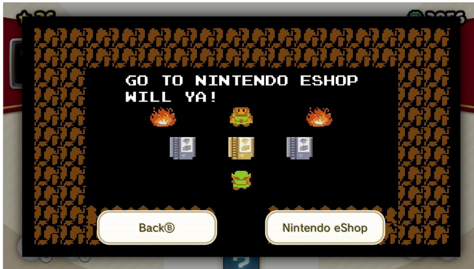
Figure 3- An example of the in-game advertisements featured in the NES Remix series.

In addition to promoting real world purchases within the game, the series also ties in to larger external marketing campaigns. NES Remix 2 launched shortly before the announcement that Nintendo would be bringing back the Nintendo World Championships for the first time in 25 years. The new Nintendo World Championships took place at retail locations across the country where players attempt to earn a high score in the NES Remix 2 championship mode for an opportunity to compete for prizes at live event during the 2015 Electronic Entertainment Expo. 120 The resurrection of the Nintendo World Championship in conjunction with Nintendo's revamped retro properties show that once again, Nintendo's keen awareness of their own legacy informs their strategy to commodify fan nostalgia. In many ways, this parallels Nintendo's use of Amiibo Tap to expose new players to classic games on the Virtual Console. Unlike Amiibo Tap —a free game designed to expose players to short demos of purchasable retro games, NES Remix is a full retail title which cheekily weaves online purchasing prompts into gameplay while actively